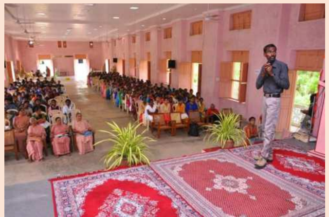
International Conference on ‘Applied Science’